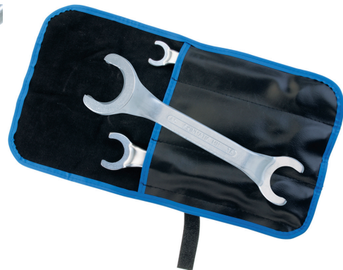
SKINMATIC® MH Set