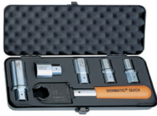
SKINMATIC® QUICK Set 1